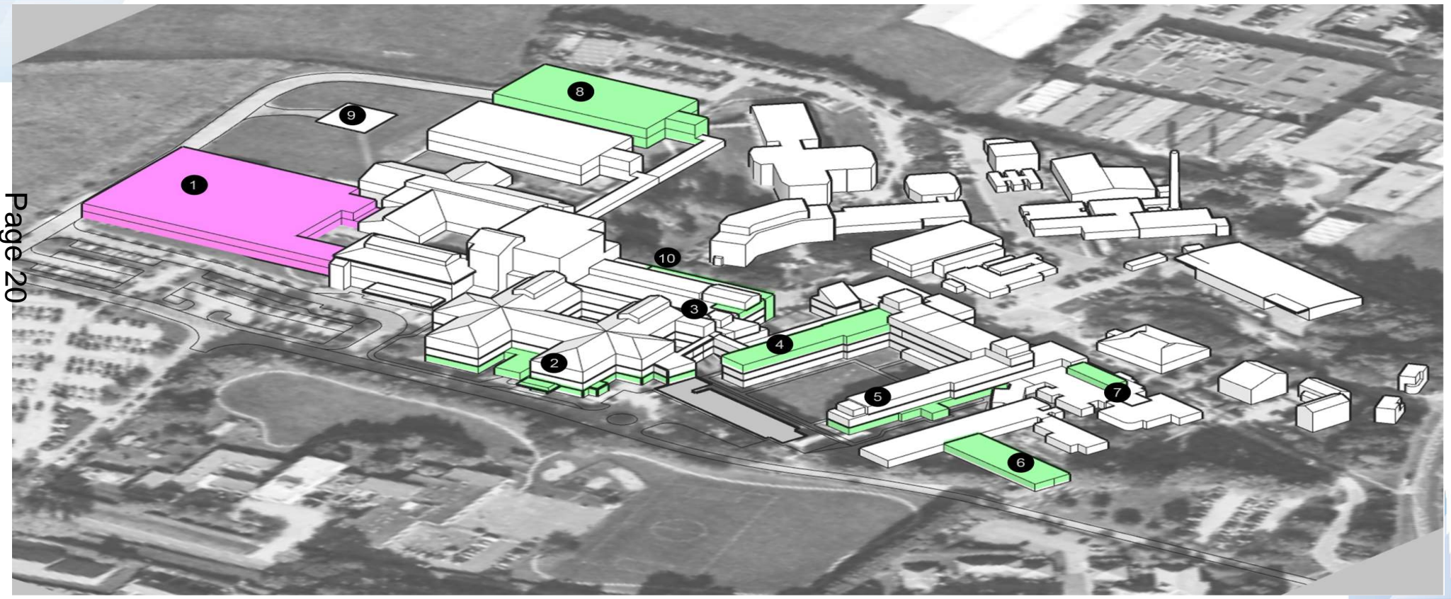
The project sits within the SGH SDP and YTHFT's Estate Strategy